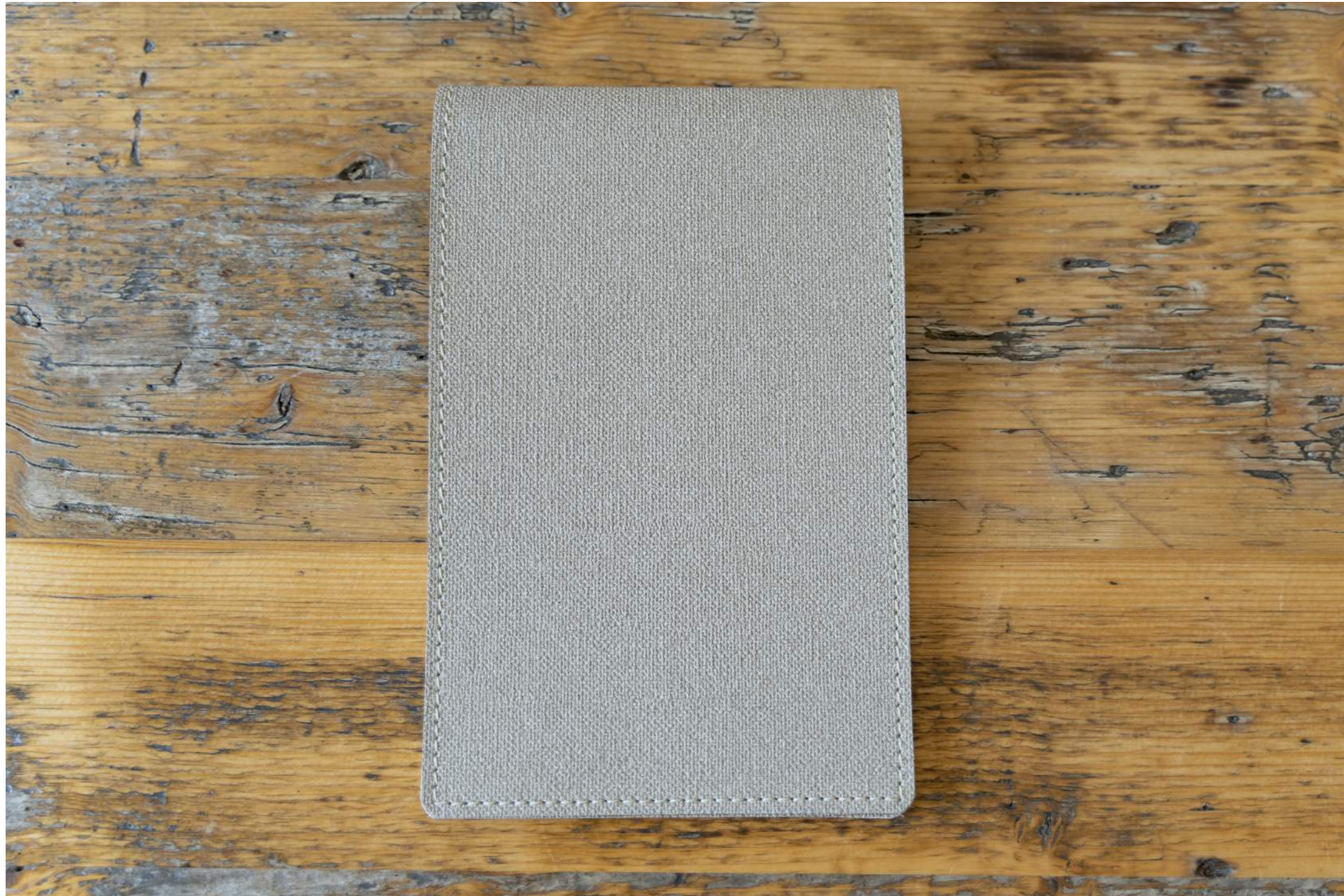
CARD & BILL FOLDER